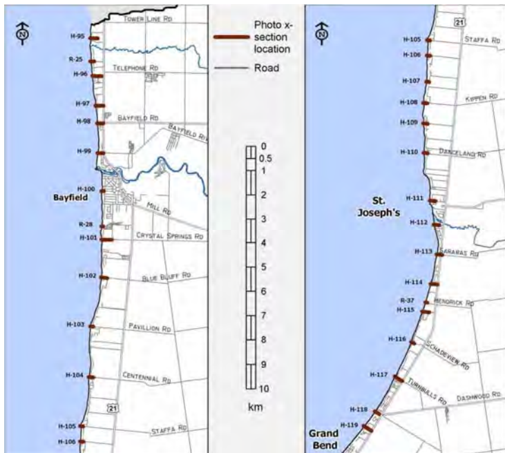
Figure 2.1 Erosion Monitoring Stations – Photogrammetric x-sections

Within the ABCA cohesive bluff areas there are 25 Environment Canada stations starting with station H-95 in the north to station H-119 in the south. An additional five stations occur in the dynamic beach area of the watershed in Lambton County. These stations are represented as a line feature in the mapping system. Three Reinders and Associates stations were added to the line feature and are labeled as R-##. See Figure 2.1. and Tables 2.1 and 2.2.