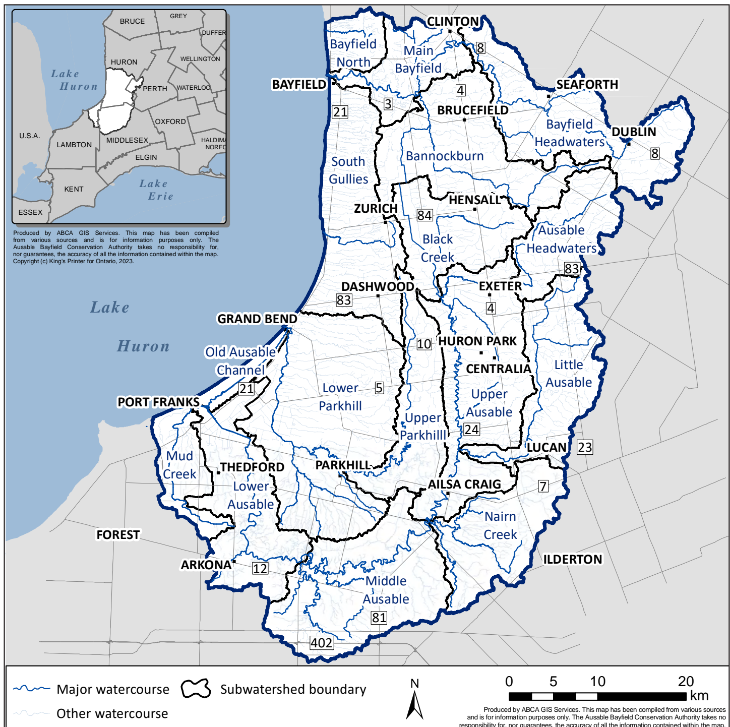
Map 2: Sixteen subwatersheds of the Ausable Bayfield Conservation Authority area.