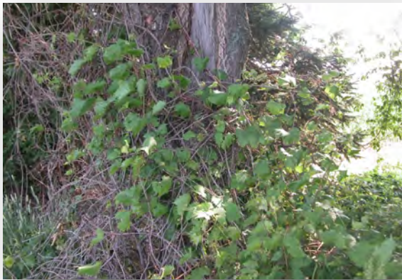
Wild Grapevine.