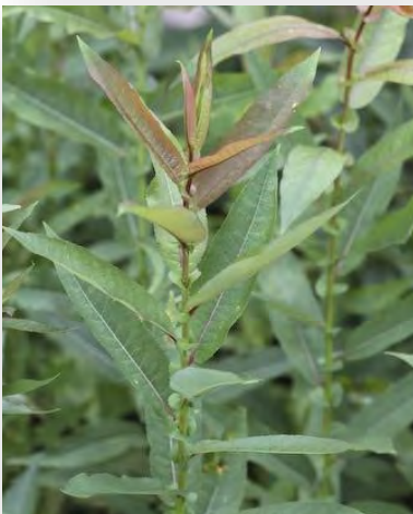
Woolly Willow.