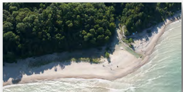
Cedars along shoreline.

Bare ground under cedar is normal due to shading. It is not a concern due to the interconnecting web of cedar roots.