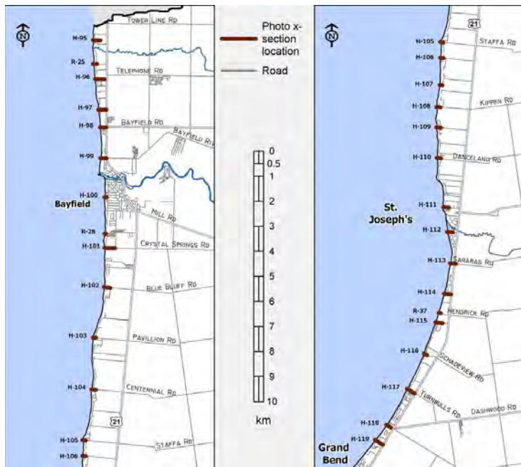
Figure 2.1 Erosion Monitoring Stations – Photogrammetric x-sections

Within the ABCA cohesive bluff areas there are 25 Environment Canada stations starting with station H-95 in the north to station H-119 in the south. An additional five stations occur in the dynamic beach area of the watershed in Lambton County. These stations are represented as a line feature in the mapping system. Three Reinders and Associates stations were added to the line feature and are labeled as R-##. See Figure 2.1. and Tables 2.1 and 2.2.